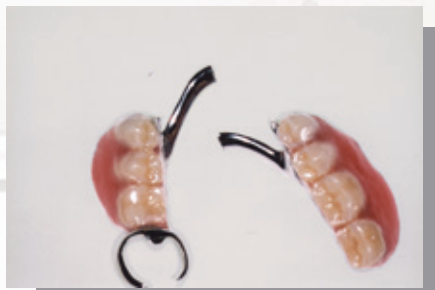
Broken partial denture