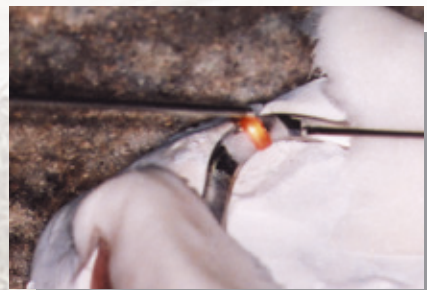
Soldering of the point of fracture