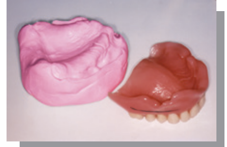
Model for repairs