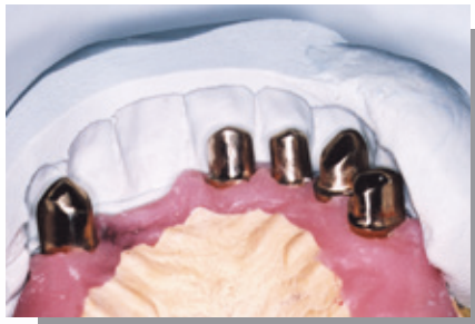
Matrix for facings