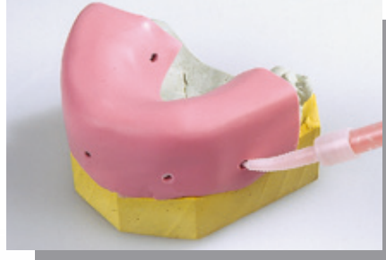
Key for gingival mask