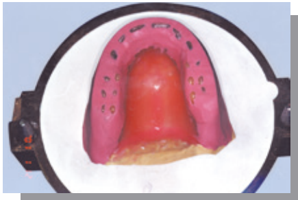
Isolation / denture heat protections