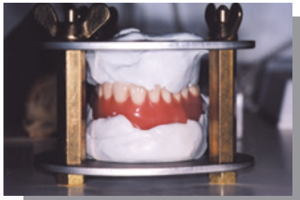
Full denture relinings