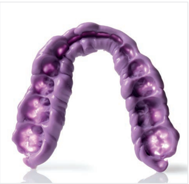
* Clinical use times are intended as from the start of mixing at 23 °C / 73 °F. ** The time in mouth is intended as at 35 °C / 95 °F.