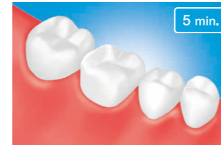
5 min. Maintain isolation for 5 minutes.* * For a translucent restoration, light-cure.