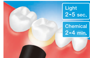
Light-cure 2-5 sec. Chemical-cure 2-4 min. Light-cure for 2 to 5 seconds or chemical-cure for 2 to 4 minutes, then remove the excess cement.