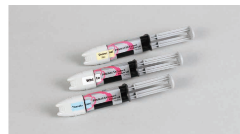
PANAVIA™ SA Cement Universal Handmix

· Universal (A2) · White · Translucent Content: 1 syringe: Paste A and B: 8.2 g (4.6 mL), Mixing Tip: 20 tips