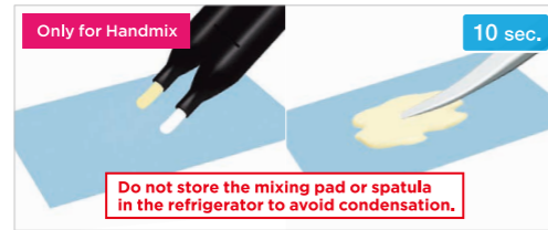
Only for Handmix 10 sec. Do not store the mixing pad or spatula in the refrigerator to avoid condensation. Dispense an equal amount of Paste A & B. Mix Paste A & B for 10 seconds.