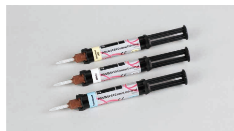
PANAVIA™ SA Cement Universal Automix

· Universal (A2) · White · Translucent Content: 1 syringe: Paste A and B: 8.2 g (4.6 mL), Mixing Tip: 20 tips