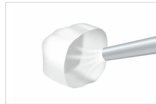
Conditioning the crown.* * Refer to "Conditioning the prosthetic restoration".

Zirconia, Lithium Disilicate or Metal. No primers required. One single procedure regardless of the restorative material.