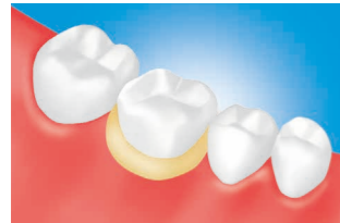
Place the crown.