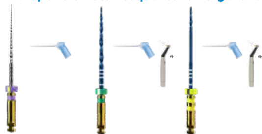
Slider 016.002v FX 035.012v FXL 050.010v

* SmartLite® Pro EndoActivator® coming soon