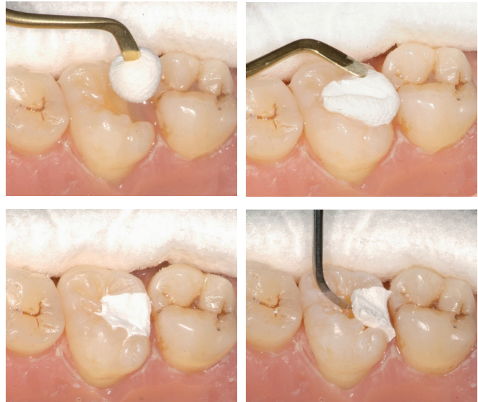
One component without mixing. Good retention in the cavity. Easy removal.

Coltène/Whaledent Inc. 235 Ascot Parkway Cuyahoga Falls, OH 44223 / USA Tel. USA & Canada + 1 800 221 3046 + 1 330 916 8800 Fax +1 330 645 8704 info.us@coltene.com