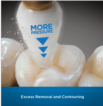
Excess Removal and Contouring